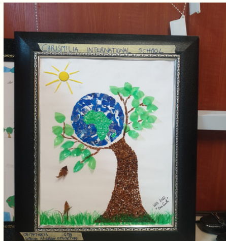
art by a green club school