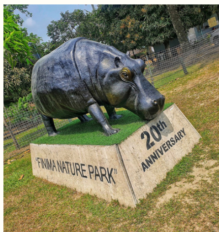
finima nature park iconic hippo statue