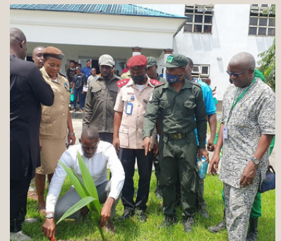
Tree Planting on WED 22

Nevertheless, our contribution toward a more sustainable and habitable environment is indelible. The fourth day of the event was held at the RA and Coal beaches respectively.