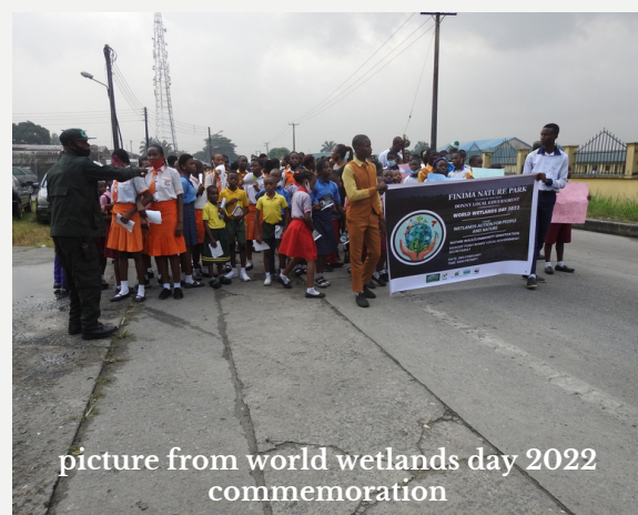
picture from world wetlands day 2022 commemoration

The theme for this year's World Wetlands Day is "WETLANDS ACTION FOR PEOPLE AND NATURE".