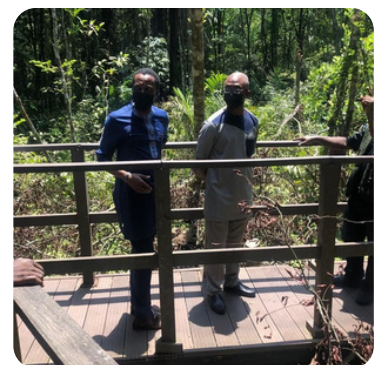
Tourist at the first walkway