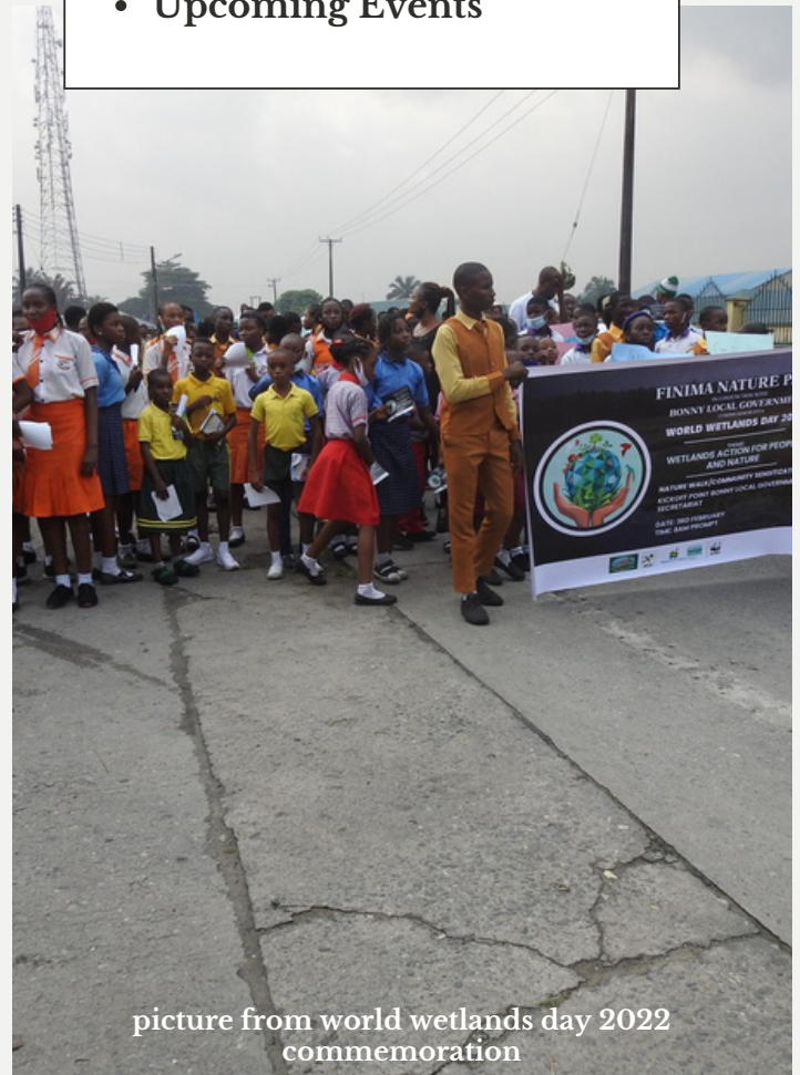
picture from world wetlands day 2022 commemoration

In commemoration of the World Wetlands Day 2022, a community Wetland sensitization walk was organized on the 3rd of February, 2022 with tree planting exercise within the community to mark the event with the attendance of 120 people which comprises of Bonny Youths Federation executives, Bonny Local Government Council members, National Orientation Agency, NYSC members, pupils and students of 9 schools on the island and their coordinators and were led by Finima Nature Park team.