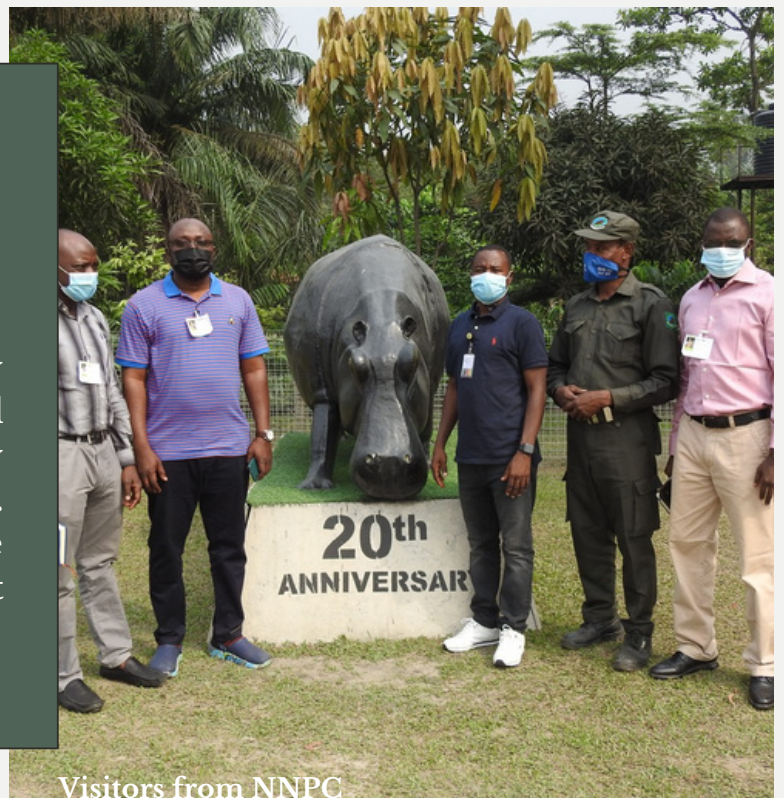
Visitors from NNPC

Natures medicine chest : Many disease-battling medicines sold world wide are derived directly from plants found in rainforests. From the cancer drug vincristine to quinine, which is used to treat malaria.