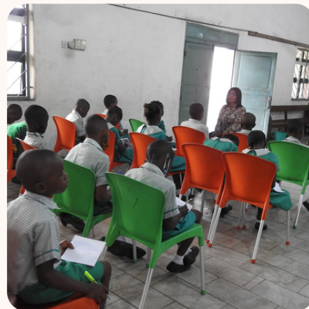
School outreach program