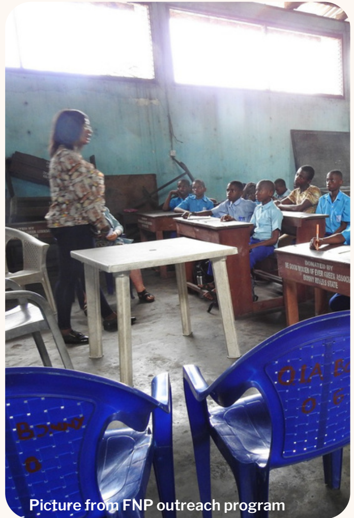
Picture from FNP outreach program

Every individual should also take steps to preserve biodiversity. One should avoid cutting down of trees because it destroys the habitats of animals and birds, it causes floods and fires, it affects the discovery of new herbal medicines ect. Afforestation should be encouraged because it prevents soil erosion, it stabilizes the climate, improves watershed and preserve wildlife.