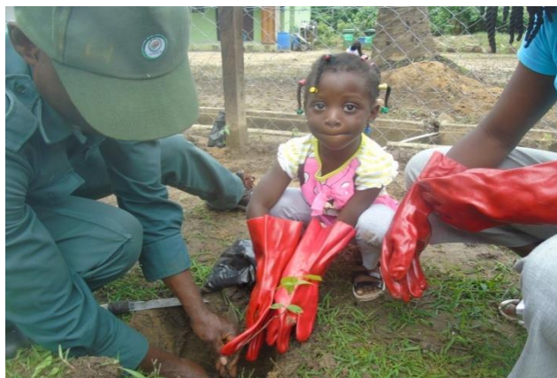
Cross section of participants at the Plant –A-tree event