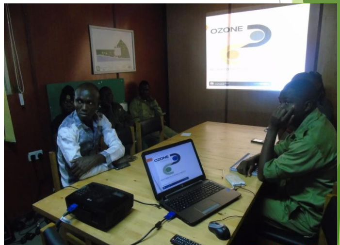
Cross-section of Participants

Our take home is to plant more trees, bring back the forest, lets all get cleaner air, take more walks, car pooling, lets trace our steps back to nature, do less of take-away, buy more of eco-sustainable products, lets practice proper waste segregation. We are already in change, therefore, I implore you all, be the change that you want to see.