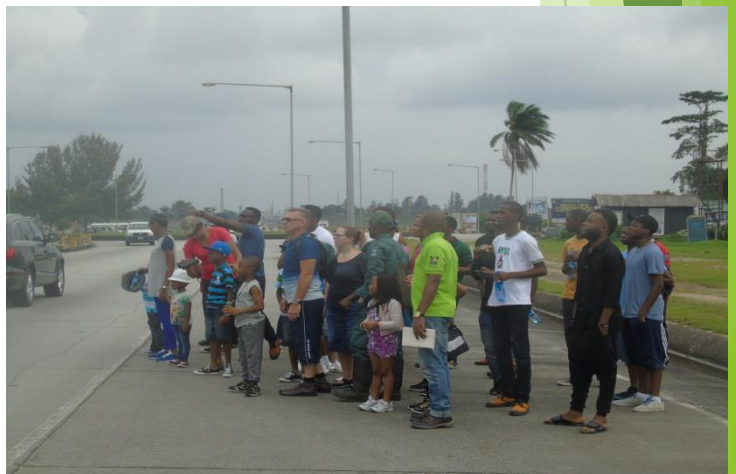
A cross-section of bird watchers