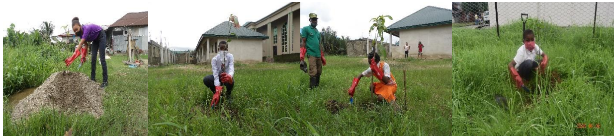
Fig. 17, 18, 19 & 20 - Show pictures of tree planting by students in various schools

The tree planting exercise continued during this reporting month. The planting exercise has covered 25 schools comprising of Primary schools, Junior secondary schools, Senior secondary schools and private schools with planting space within their school premises. Several communities - Abalamabie, Abraham-Hart, Oguede, Coconut Estate, Lighthouse, amongst others have been covered. A total of 2100 tree seedlings have been planted, while the exercise will continue in July and other months.