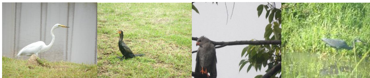
Fig. 1, 2, 3 & 4 Show pictures of the Great Egret, Long-tailed Cormorant, Lizard Buzzard and Western Reef Heron

The regular biodiversity surveys and biological monitoring were carried out this month using both direct and indirect monitoring techniques. Diverse species of fauna were sighted during these surveys among which were insects, amphibians, reptiles, birds and mammals. Some of the species sighted are Great Egret ( Egretta alba ), Long-tailed Cormorant ( Phalacrocorax africanus ), Lizard Buzzard ( Kaupifalco monogrammicus ), Western Reef Heron ( Egretta gularis ) and Mona Monkey ( Cercopithecus mona ) among others. A representation of this is included in the monthly species checklist attached to this report.