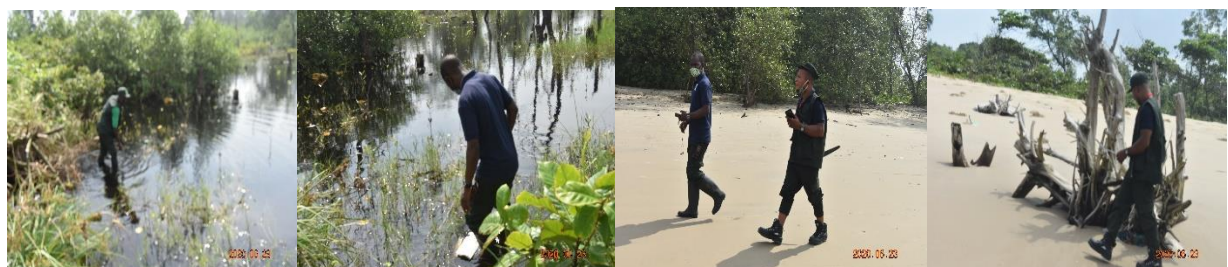
Fig. 13, 14, 15 & 16 Show pictures of the Officers during the anti-poaching patrol