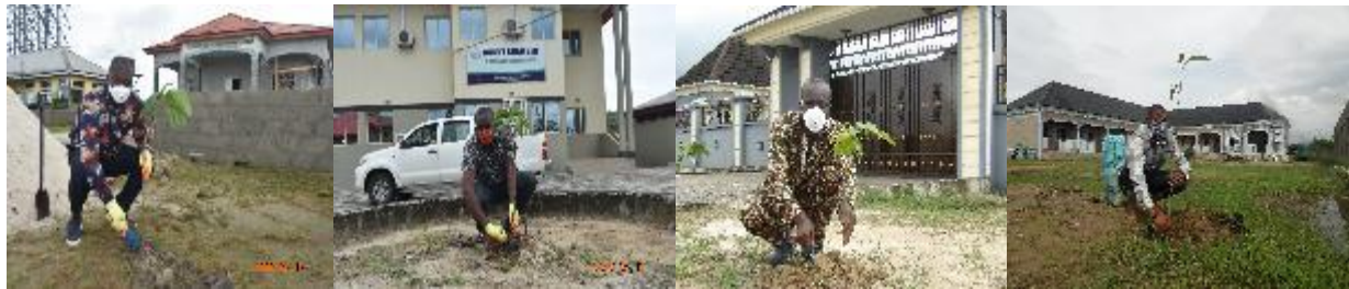
Fig. 21, 22, 23 & 24 Show pictures of Bonny Youth Federation Chairman, BECC Representative and other community members during the planting