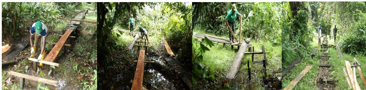
Fig. 53, 54, 55 & 56 Show pictures of the Officers during the maintenance of Agaja Trial