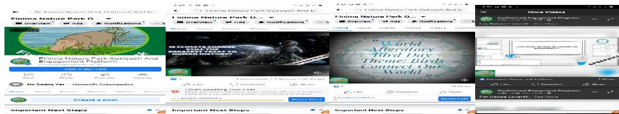
Fig. 37, 38, 39 & 40 Show pictures of the screenshots of post from the Finima Nature Park Outreach and Engagement Platform

Conservation club activities has been put on hold due to Corona Virus pandemic which has necessitated the closure of all schools till further notice. However, the outreach and engagement team created a Facebook group (Finima Nature Park Outreach and Engagement Platform) as a medium to enlighten/engage the public on environmental issues.