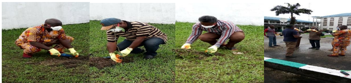
Fig. 45, 46, 47 & 48 Show pictures of the Bonny Local Government Executives during the tree planting exercise to commemorate World Environment Day, 2020