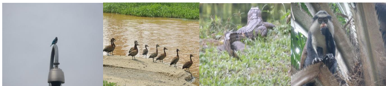
Fig. 9, 10, 11 & 12 Show pictures of the Woodland Kingfisher, White-faced Whistling Ducks, Nile Crocodile and Mona Monkey