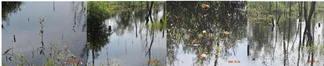
Fig. 29, 30, 31 & 32 - Show pictures of the Red Mangrove planted with more than 98% surviving rate