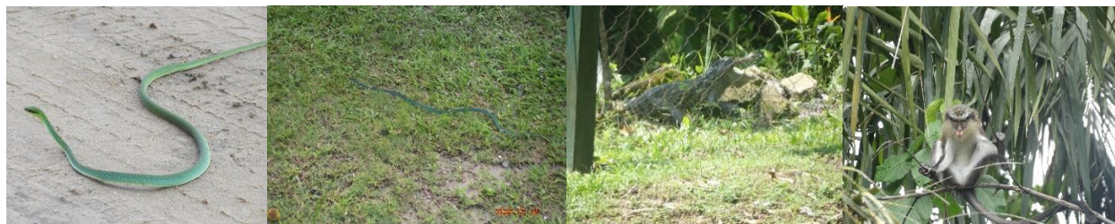
Fig. 5, 6, 7 & 8 Show pictures of Green Tree Snake, Emerald Snake, Nile Crocodile and Mona Monkey