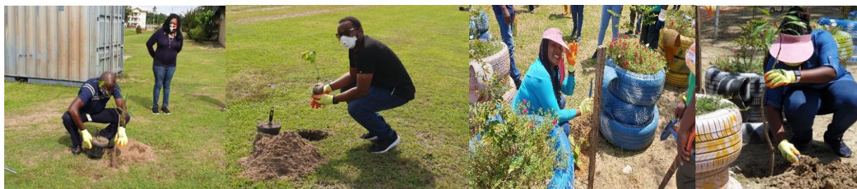
Fig. 41, 42, 43 & 44 Show pictures of the tree planting exercise by NLNG Mgt & RA Ladies Exco - to commemorate World Environment Day, 2020