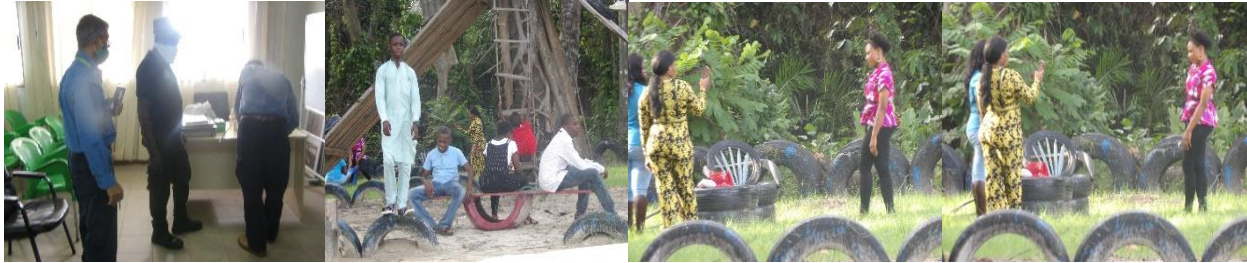
Fig. 33, 34, 35 & 36 Show pictures of tourist that visited during this month prior to the total lockdown on the Island

In compliance with the social distancing and movement restriction directive to prevent the spread of Corona virus, the Park was officially closed to the public. The restriction has been in place from Monday, 23 rd March till date. The impact of this and the current local down of Bonny Local Government Area is that number of visitors/tourists to the park has been severely limited – especially for the reporting month.