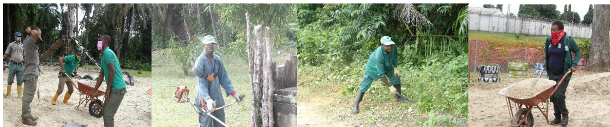
Fig. 49, 50, 51 & 52 Show pictures of the Officers during the Housekeeping

Tidiness of the boardwalk and other Park facilities were carried out during the month i.e. sweeping of the trail, clearing and cutting of tree branches that fell along the board walk, cleaning of the drainage and sand filling of the playground etc. Also, maintenance work on the Agaja Nature Trail was carried out during this reporting month