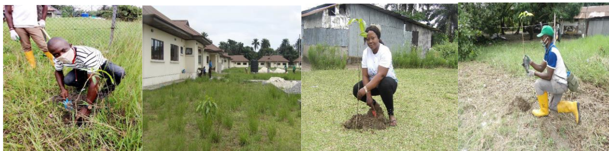
Fig. 25, 26, 27 & 28 Show pictures of tree planting exercise in Bonny & Finima communities