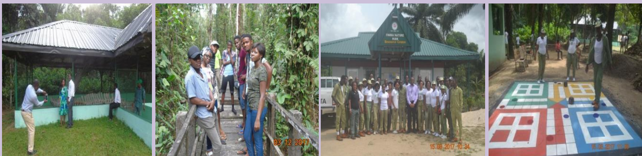
Fig. 9, 10, 11 & 12 shows Cross section of individual and corporate visitors to the Park during the week

Ecotourism: Visitors were conducted round the Park.