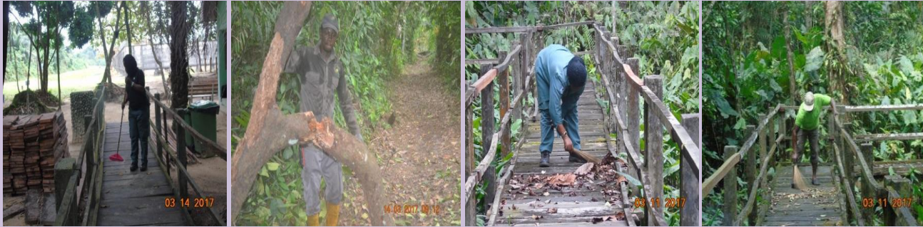
Fig 13, 14, 15 & 16 shows Cross section of Park Guards performing Housekeeping job along the walkways

inspection was also carried out during the week; nine damaged handrails were replaced during the week