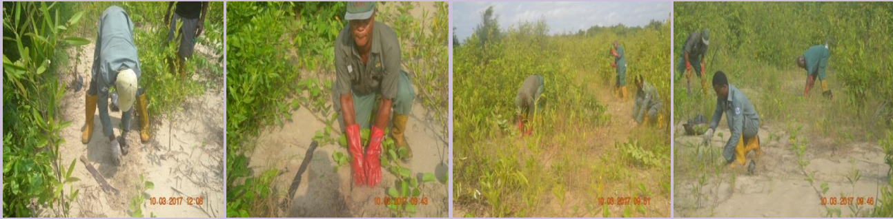
Fig. 29, 30, 31&32 shows Planting of Mangrove propagues seedling by Field staff (Mangrove restoration program at the Eastern Bloc of the park).