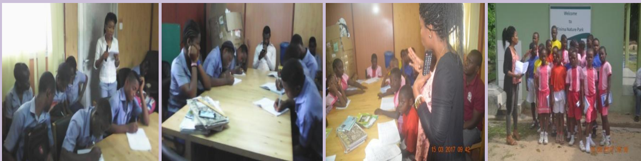
Fig. 5, 6, 7 & 8 shows Cross section of Legacy International School and Vine International School visits during the week

Ecotourism: Visitors were conducted round the Park.