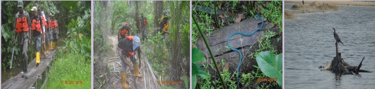
Fig. 1, 2, 3, & 4 shows photos of Park Rangers on Anti-poaching Patrol, destruction of confiscated item, Green snake and Long-tailed cormorant during our Biological monitoring